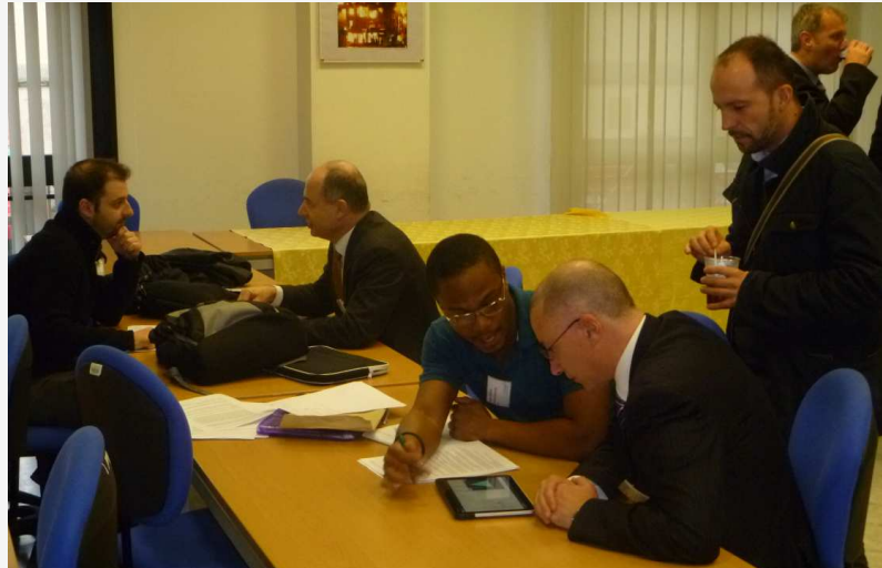
TEASE experiment: Many participants had the opportunity to test and provide feedback during the 2 days of the conference